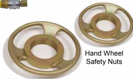
Hand Wheel Safety Nuts