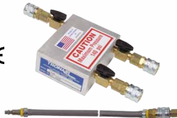
K-1106 Air Pump Manifold Kit