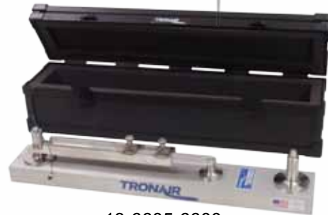
13-6605-6600 Actuator Adjustment Tool