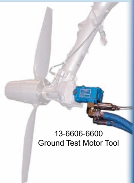
13-6606-6600 Ground Test Motor Tool