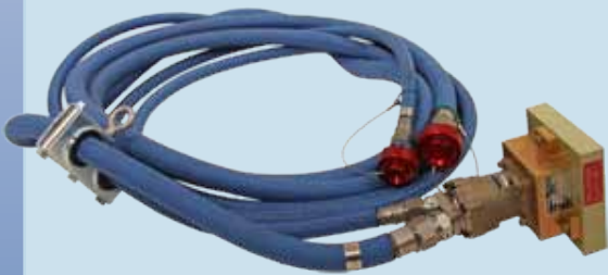
13-6614-6600 Ground Test Motor Tool

Canadair CRJ and Challenger, Falcon 7X, Gulfstream G650