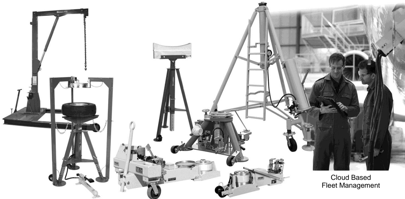
Cloud Based Fleet Management

The Tronair Family of Ground Support Equipment and cloud based EBis GSE Fleet Management